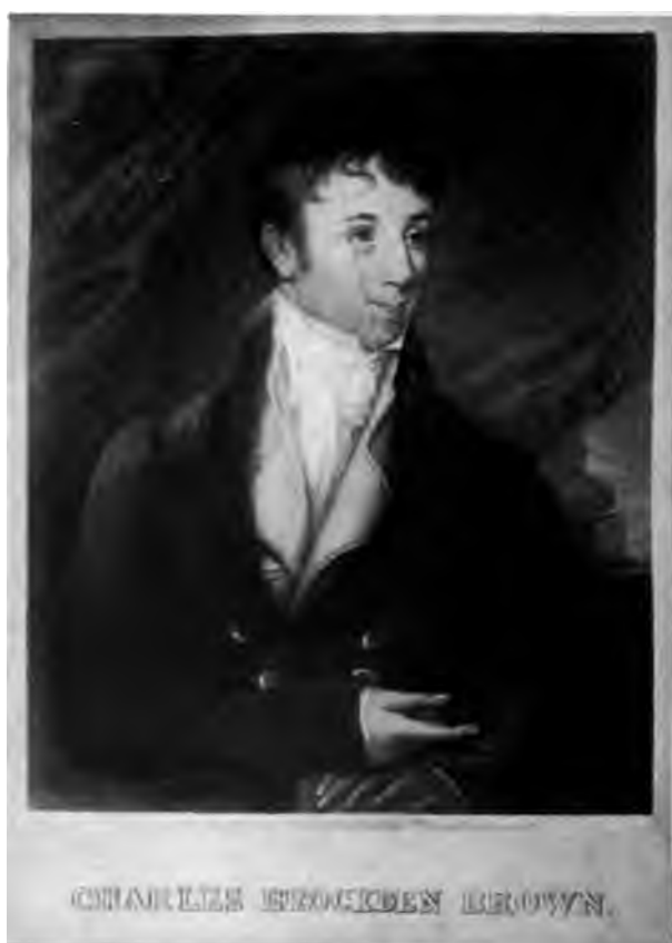
From a miniature painted by William Dunlap, 1806, engraved by J. B. Forrest; reproduced from National Portrait Gallery of Distinguished Americans , 1835.